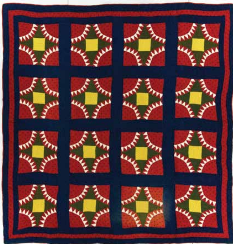
New York Beauty, Possibly made in Pennsylvania or Maryland, c. 1880-1900 International Quilt Study Center, 2003.003.0153

Modern Age quilts come in all different formats, colors, and styles. Take a walk through seventy years of American quilts, and discover how modern and anti-modern elements are evident in the changing fashions of quilting.